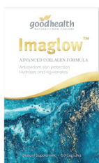
GOOD HEALTH Imaglow Advanced Collagen