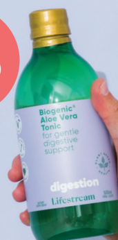
Lifestream Biogenic ® Aloe Vera Tonic 500mL

Extra phycocyanin helps to support optimal energy + stamina