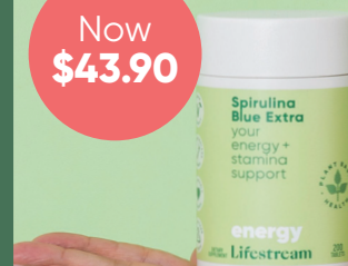
Lifestream Spirulina Blue Extra 200 Tablets

Supports healthy digestion + bowel regularity